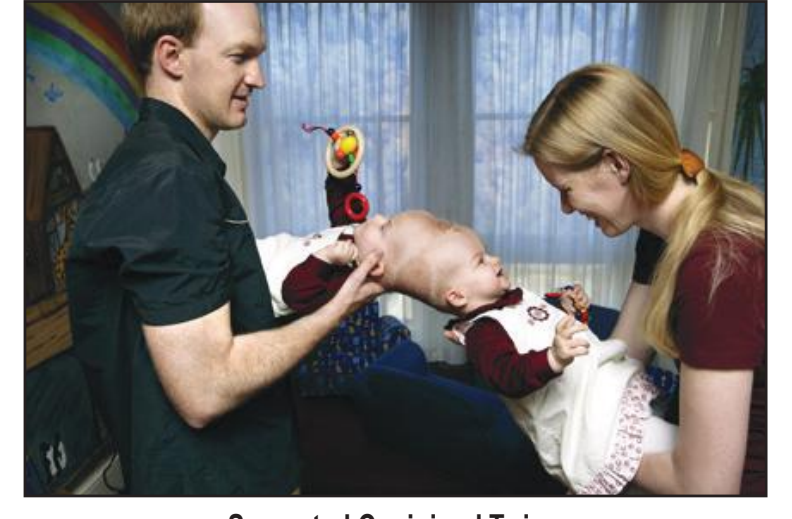
Separated Conjoined Twins